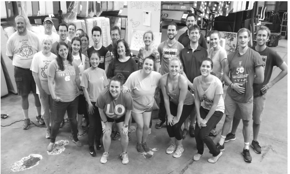
Beds for Kids Volunteers